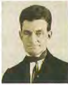
abolitionist: John Brown was an American abolitionist in the 1800s.

2 above prep 1 : higher than : OVER < above the clouds> 2 : too good for <You're not above that kind of work.> 3 : more than <I won't pay above ten dollars.> 4 : to a greater degree than <She values her family above all else.> 5 : having more power or importance than <A captain is above a lieutenant.>